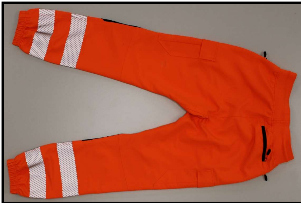
KX346 KX3 Flexi High Vis Joggers - front and reverse